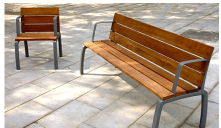
Street furniture (seating, trash cans, etc.)