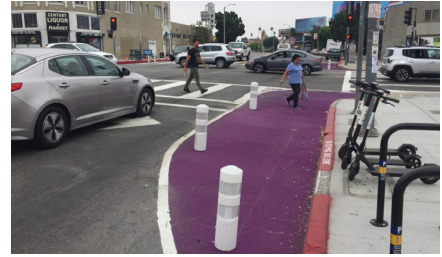
Bump out the curb at intersections