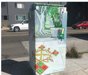
Public art that reflects local culture