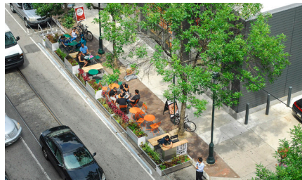
On-street plaza or parklets